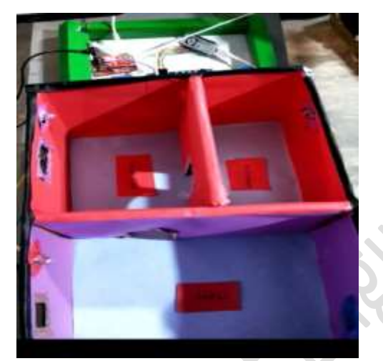
FIG 7b) : Switches When Turned Off