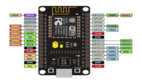
Fig A : Node MCU