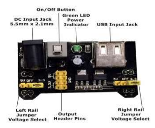
Fig C : DC Motors

A Direct Current (DC) motor is a rotating electrical device that converts direct current, of electrical energy, into mechanical energy [12]. An Inductor (coil) inside the DC motor induces a magnetic field that causes rotary motion as DC voltage is given to its terminal. Inside the motor there is an iron shaft, wrapped in a coil of wire. This shaft contains two fixed, North and South, magnets on both sides which cause both a repulsive and attractive force, in turn, producing torque.