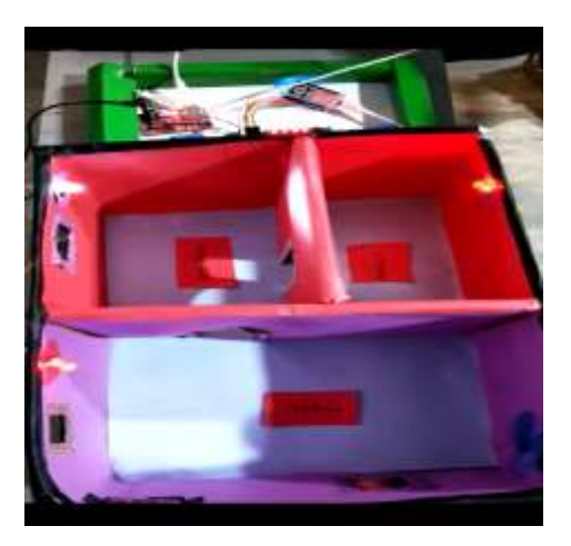
FIG 7a) : Switches When Turned On